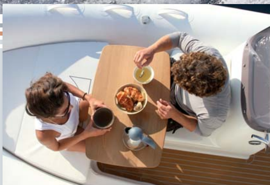
Table system towards the bow for a "dining area"