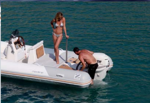
Aft bathing platform to ensure safe reboarding