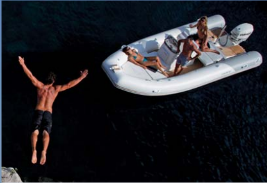
Clever convertible stern bench for an extra sundeck