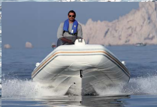
New hull, new deck, new tube